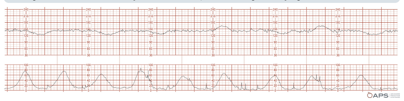
FIGURE 4 Tracing exhibits moderate variability and accelerations, thus excluding clinically significant acidemia

Late decelerations represent protective cardiovascular response to contraction-induced reductions in fetal oxygenation. Per algorithm, if labor is progressing normally in active phase or second stage, careful observation would be appropriate. If the fetus is remote from delivery, delivery would be appropriate.